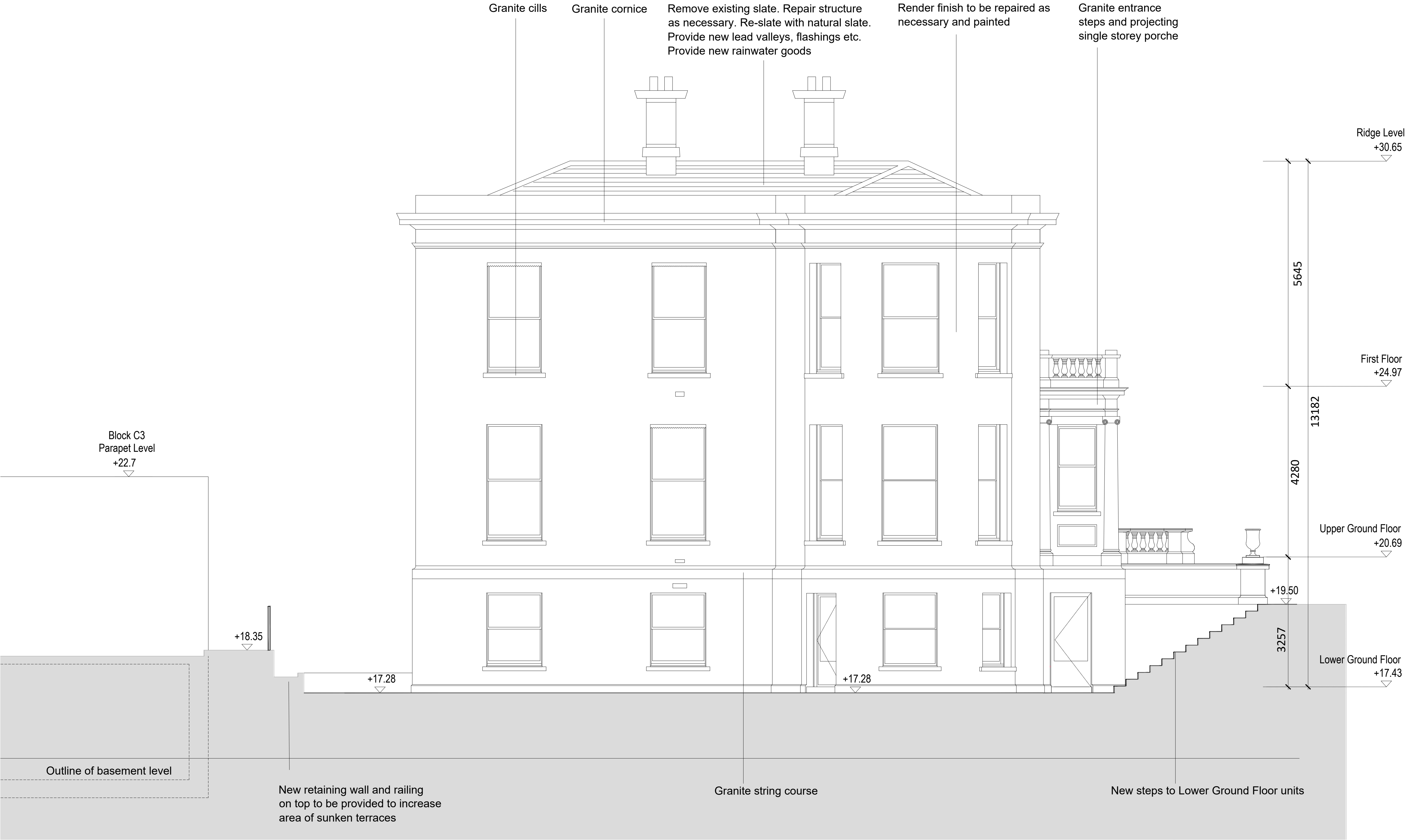
PROPOSED WEST ELEVATION - St. Teresa's House